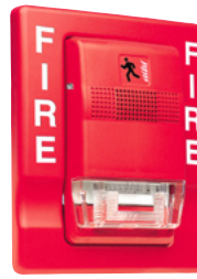
Genesis Chime-strobe with optional trim plate

Genesis chimes and strobes mount to any standard one-gang surface or flush electrical box. Matching optional trim plates are used to cover oversized openings and can accommodate one-gang, two-gang, four-inch square, or octagonal boxes, and European 100 mm square.